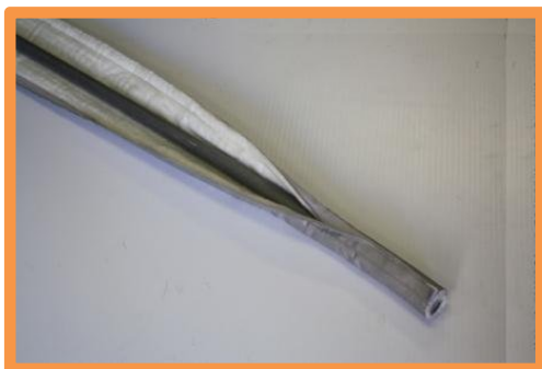
Photo above shows the wrap with the liner installed